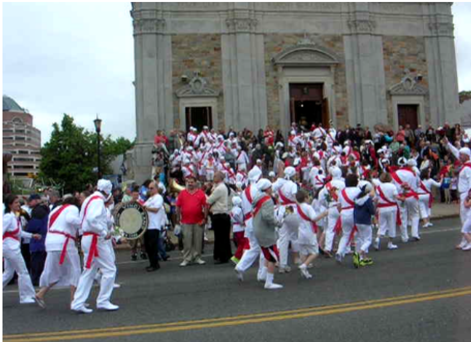
“I Nuri” running in Middletown 2013