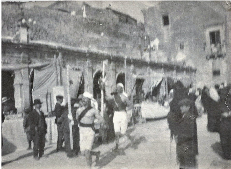
“I Nuri” running in Melilli -Original Photo around 1890