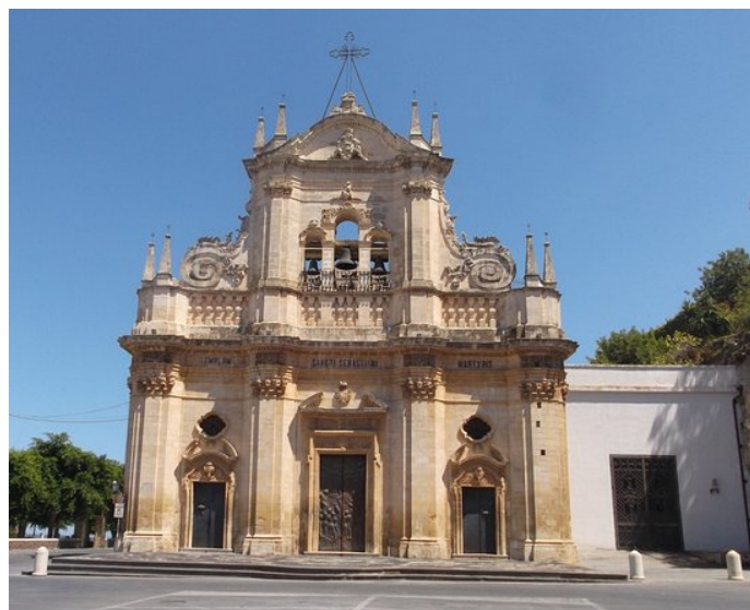
Church of Saint Sebastian – Melilli, Italy

Despite their best efforts the people of Siracusa were unable to budge the wooden case which had settled into the sand in the sea. Word spread to the nearby towns, including Melilli and by May 1 st , 1414 the priest and a number of followers from Melilli found themselves at the shipwreck site. When the people from Melilli arrived, the wooden case containing the statue appeared to lift out of the muddy water. The priest was able to pick up the wooden case and easily place it on his shoulders. The priest together with his following then headed back to Melilli where they planned to bring the statue of Saint Sebastian to the Church of San Nicolo' (known as the Chiesa Madre or main church of Melilli). As they entered the town a poor leper by the name of Pannisca ran up to the wooden case and kissed it. He was immediately and completely cured. When the priest went to pick up the wooden case it suddenly became