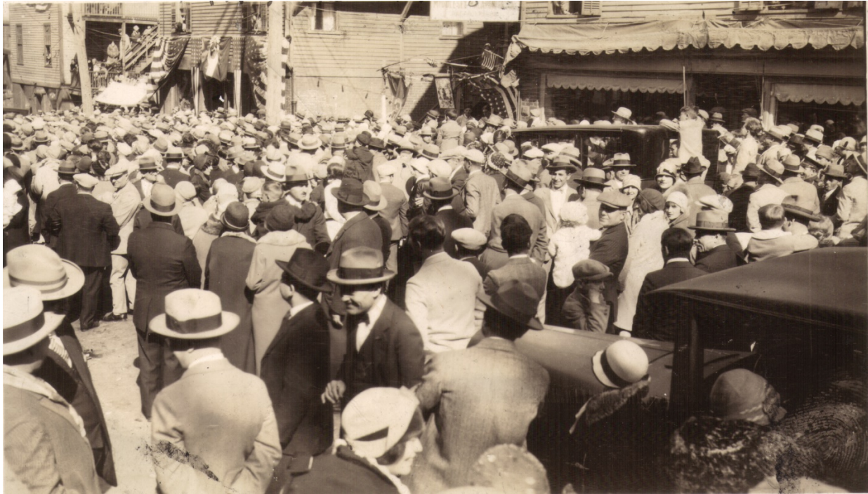
St. Sebastian Feast Celebration-May 13, 1928- Court Street – Thousands attended