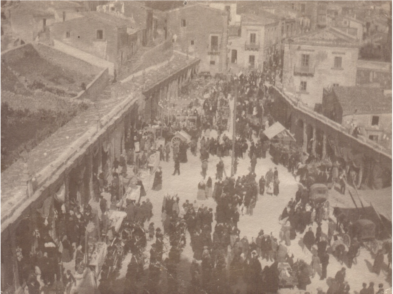
Photo of the Feast of St. Sebastian, Melilli taken from the Church looking into the Piazza -about 1890

impossible to move which was taken by the crowd as a sign that Saint Sebastian wanted to have a church built and dedicated to him at that location. 14 The rest- as they say -is history. The church was built and many additional miracles took place and were recorded. Eventually the celebration of Saint Sebastian in Melilli became an annual event complete with participation of thousands of devoted followers in Melilli and in nearby towns.