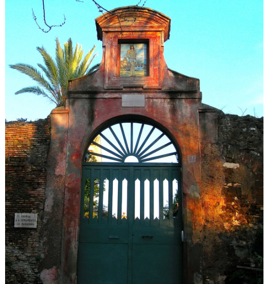
St. Sebastian Church, Palatine Hill, Rome, Italy

The history of Saint Sebastian is well known. He was born of a noble family which was originally from Mediolanum (now Milan) in AD 256 in the Roman Province of Gallia Narbonensis (near what is now Marseille in Provence, France). His father passed away shortly after Sebastian was born and his mother moved the family back to Mediolanum. Sebastian was a Christian at an early age. He studied in Milan and although a Christian decided to enter military service in the Roman Army under the Emperor Carinus. Carinus was defeated by Diocletian who enlisted the assistance of Maximian to jointly serve as Emperors of the Roman Empire. Within a brief period of time Sebastian rose in rank to become one of the Captains of the Praetorian Guards- an elite group in the Roman Army charged with protecting the Emperor. During this entire time period Sebastian had kept his Christian faith a secret.