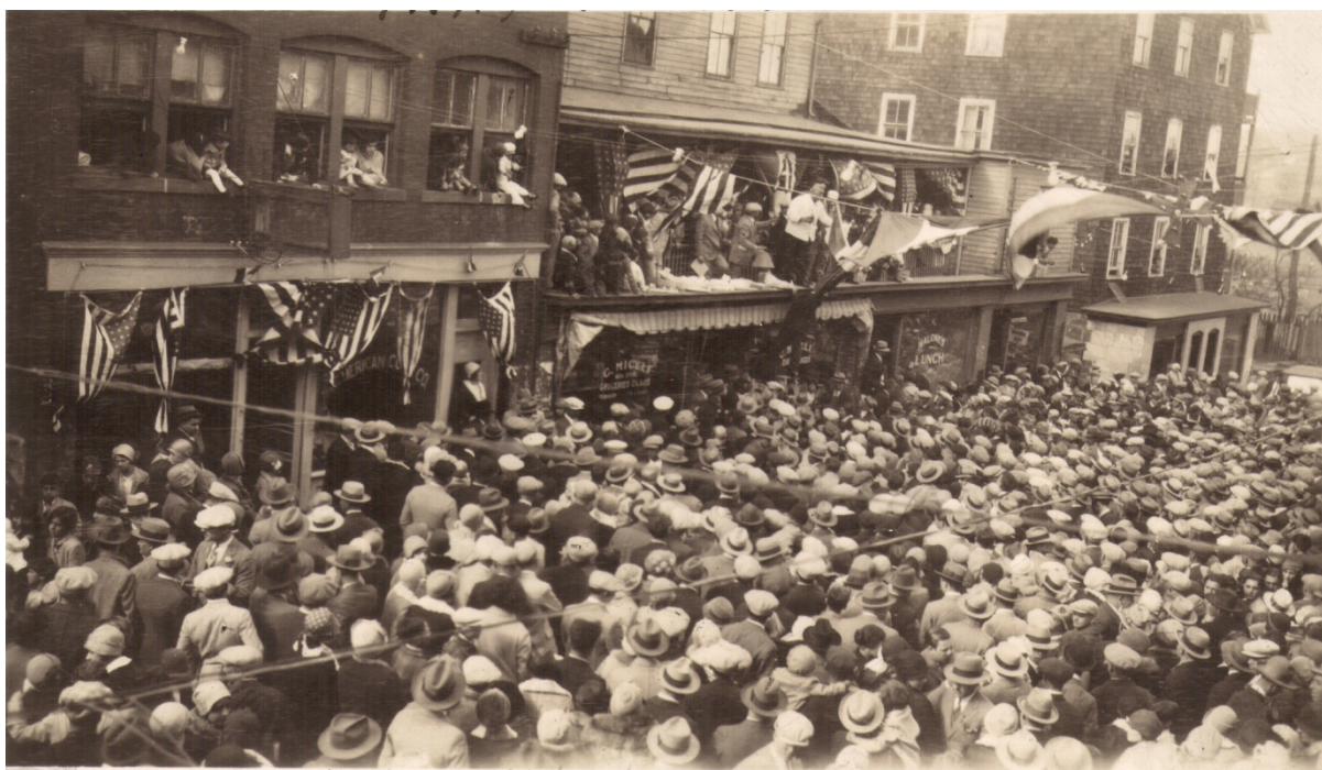
St. Sebastian Feast Celebration-May 13, 1928 – “The Auction” to raise money for the Church