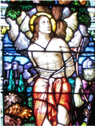
St. Sebastian stained glass window-Middletown