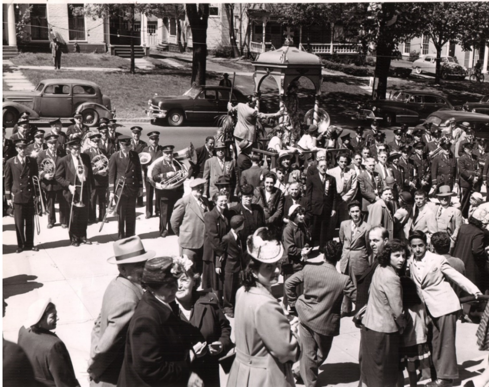
Feast of Saint Sebastian -1950

The Statue with the Marching Band and Knights of St. Sebastian in front of the Church