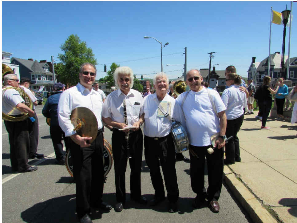
Feast of St. Sebastian- 2014 Members of the Marching Band

The Statue with the Marching Band and Knights of St. Sebastian in front of the Church