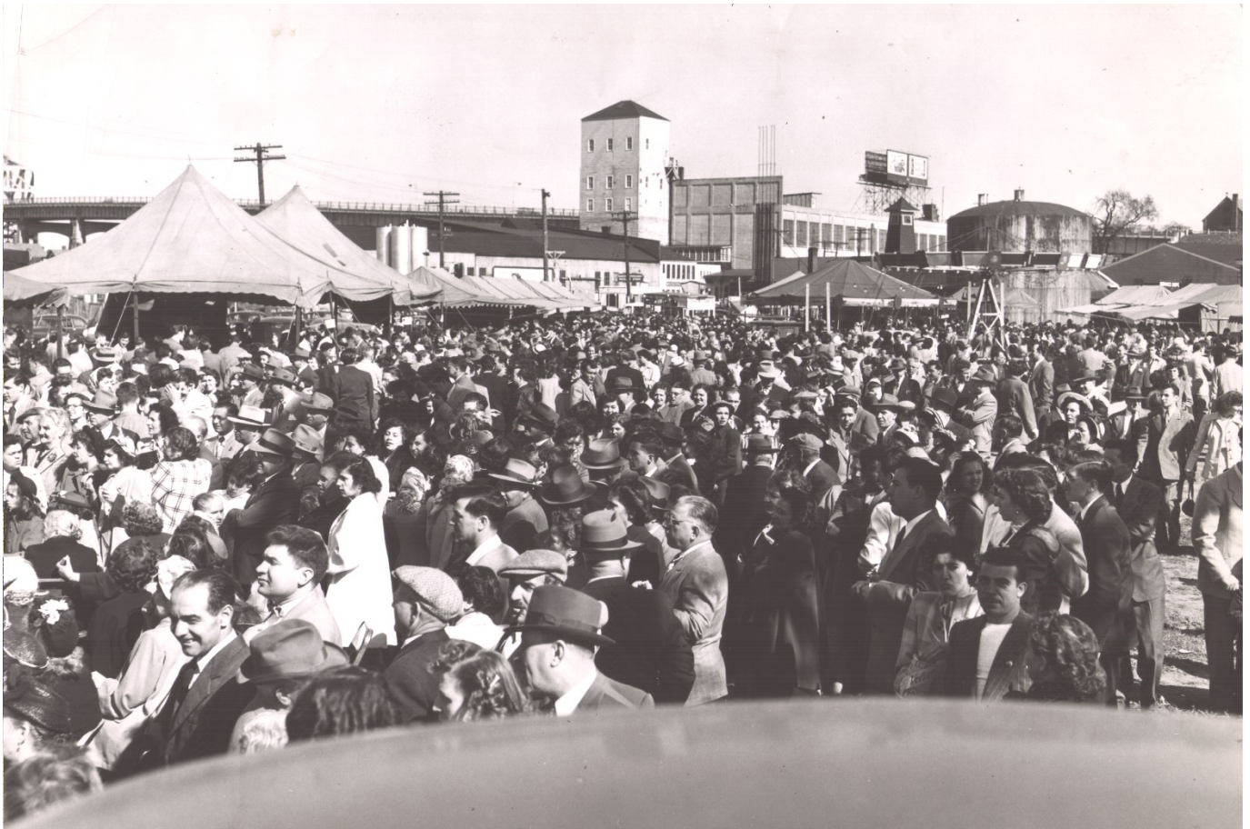
Feast of St. Sebastian – taken at the Red Wing site-North Main Street, Middletown 1940