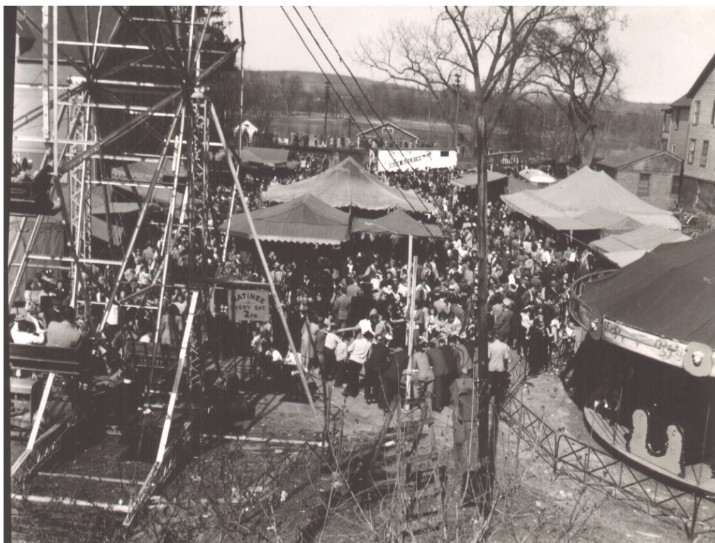
Feast of St. Sebastian- taken at the Coleman grounds off Washington Street, Middletown 1950s